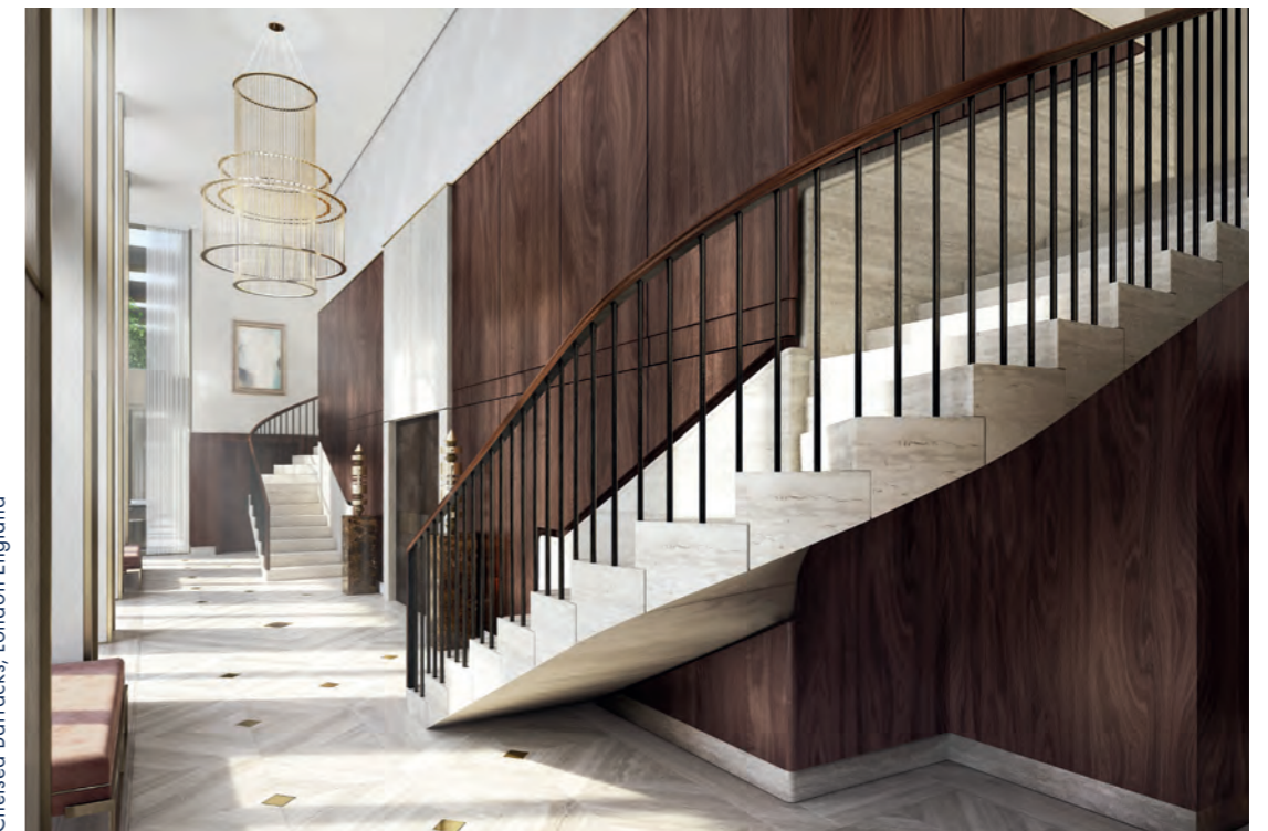
Chelsea Barracks, London England