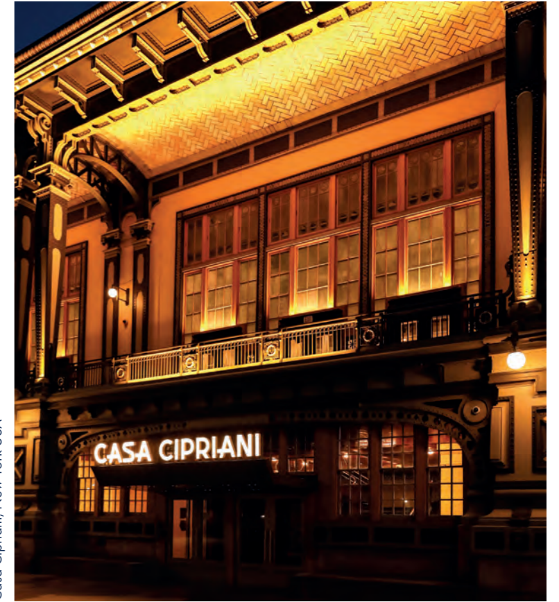
Casa Cipriani, New York USA