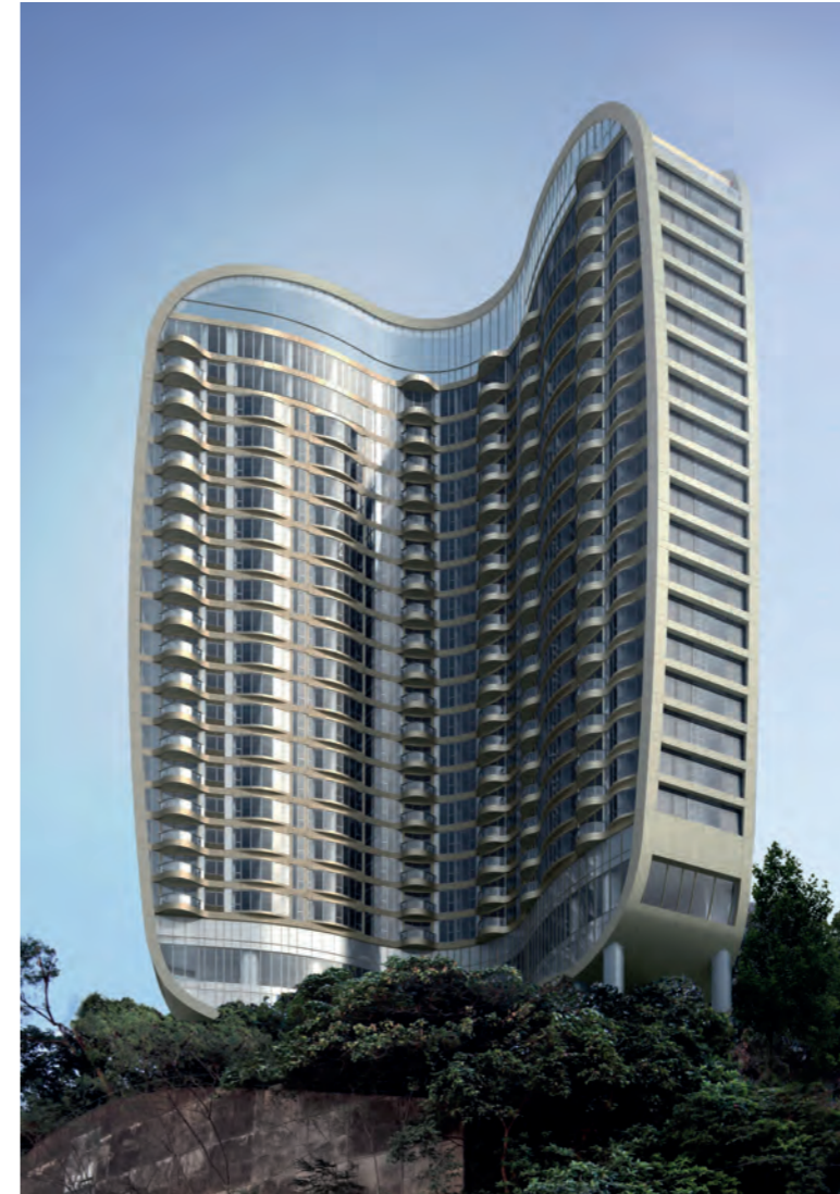
Mount Parker Residences, Hong Kong China