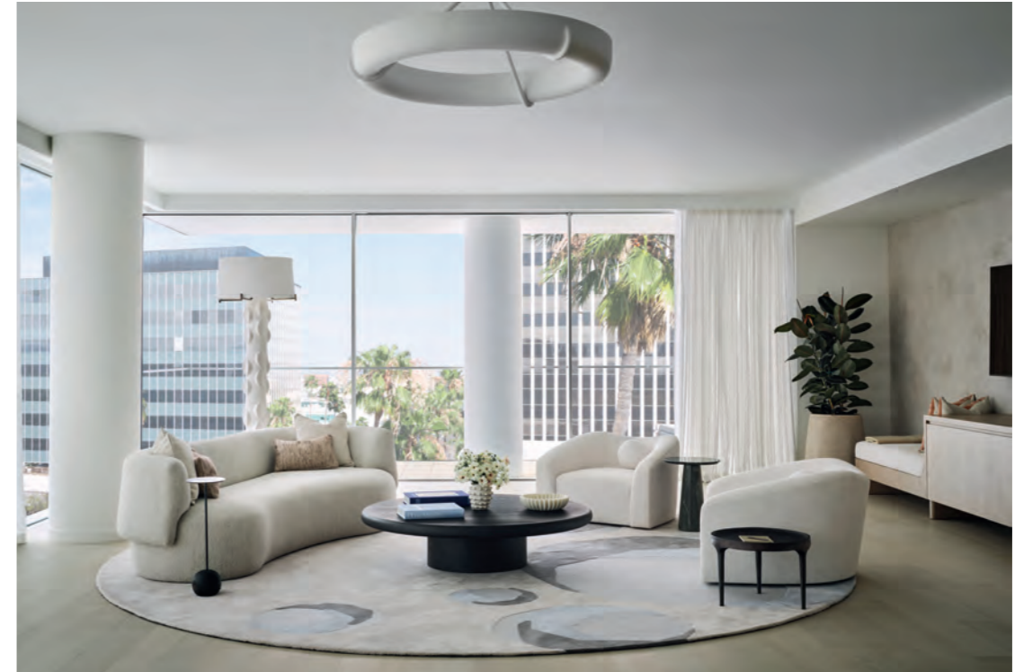
Mandarin Oriental Beverly Hills, Los Angeles USA