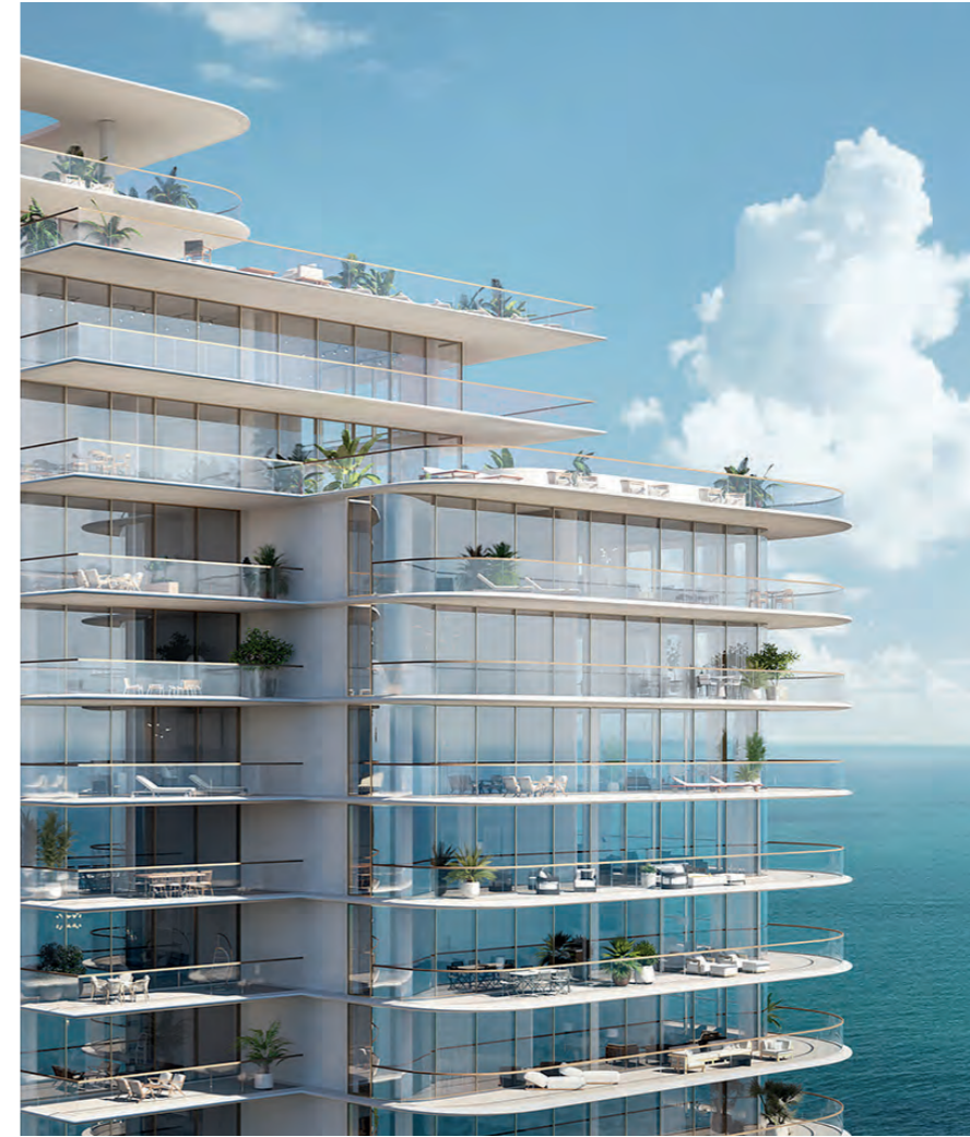
The Perigon, Miami USA