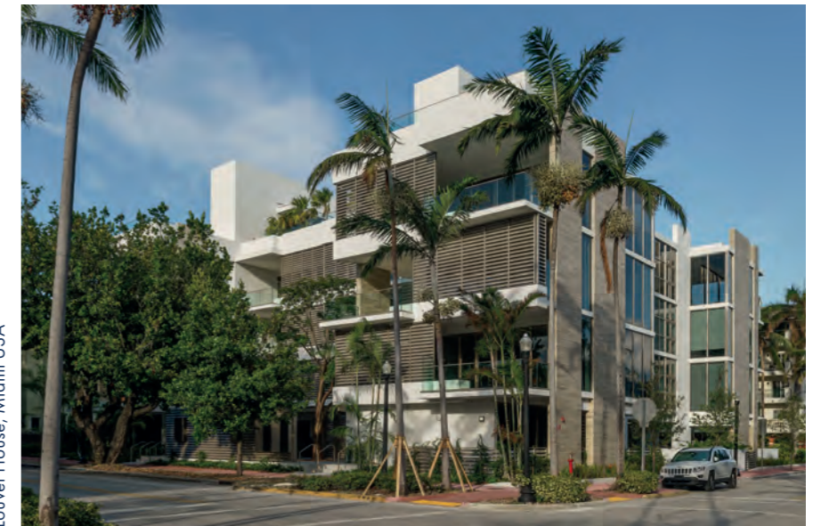
Louver House, Miami USA