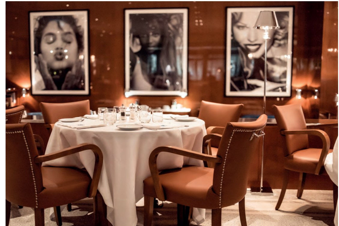
Cipriani Dubai, United Arab Emirates